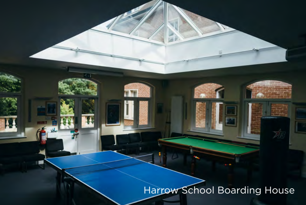
Harrow School Boarding House