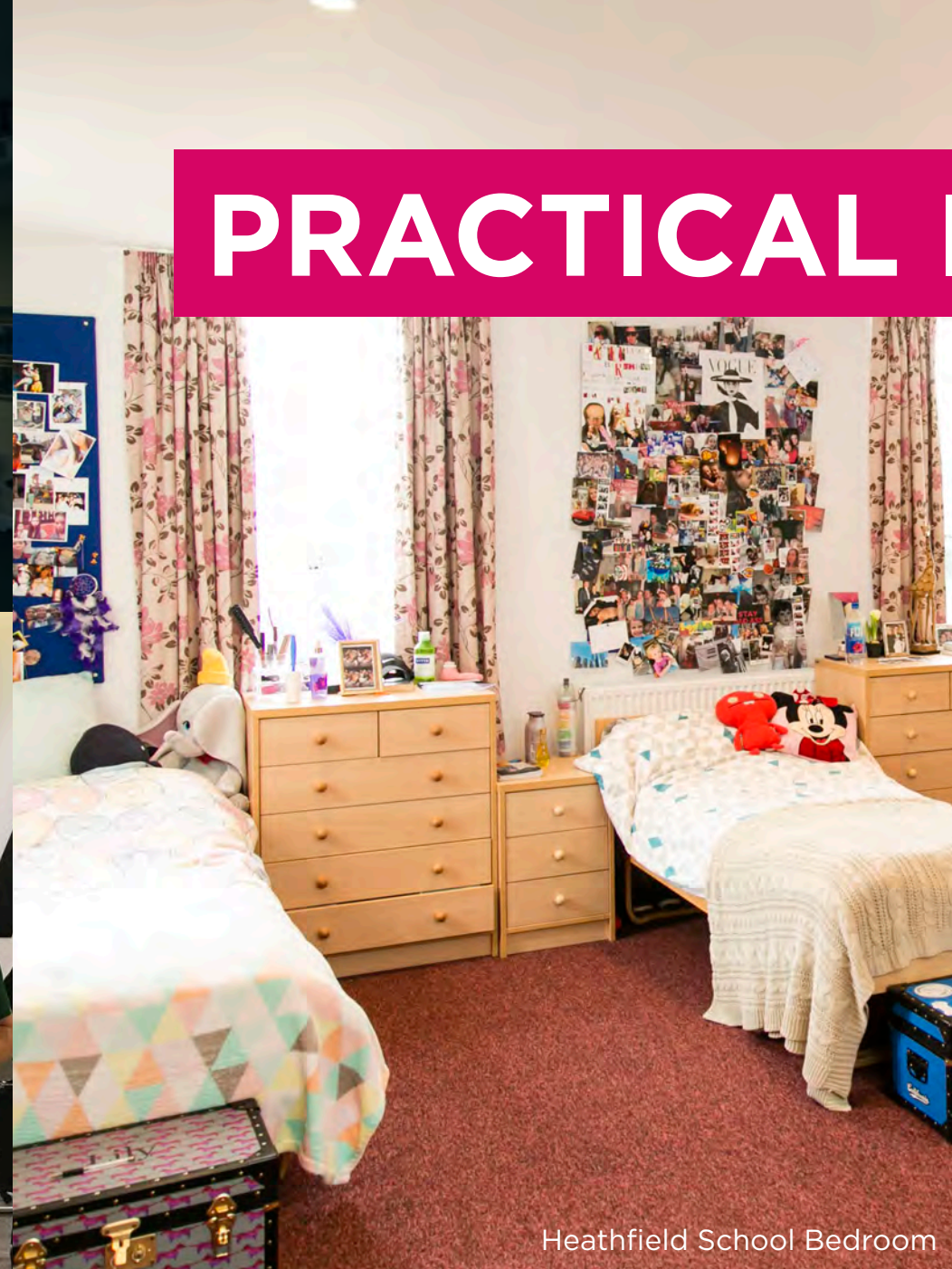
Heathfield School Bedroom

If a transfer has been requested, our staff will meet the students arriving at an airport (or St Pancras Station for Eurostar arrivals), and accompany them to their destination school. We collect any children travelling as Unaccompanied Minors directly from their airline representatives. An Unaccompanied Minor is where you pay the airline to escort your child from their home country to the United Kingdom. Please check if this service is available from your airline or Eurostar.