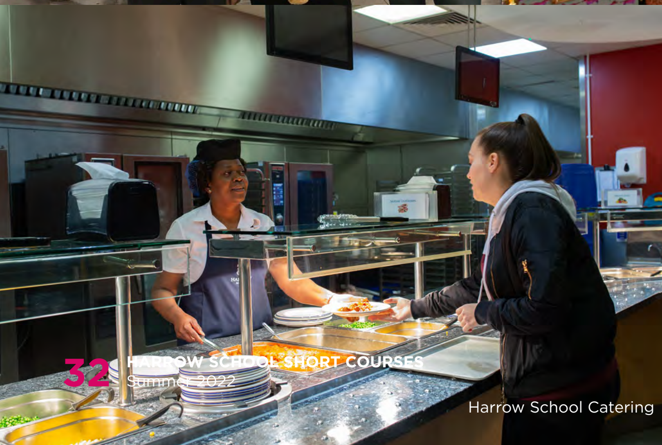
Harrow School Catering

Most meals are eaten in the school dining halls, where both hot food and salads are served. On excursions, students either eat at a café or restaurant, or are given a packed lunch. During lessons breaks, refreshments are available. All schools have a snack shop (traditionally called a 'tuck shop') or vending machines.