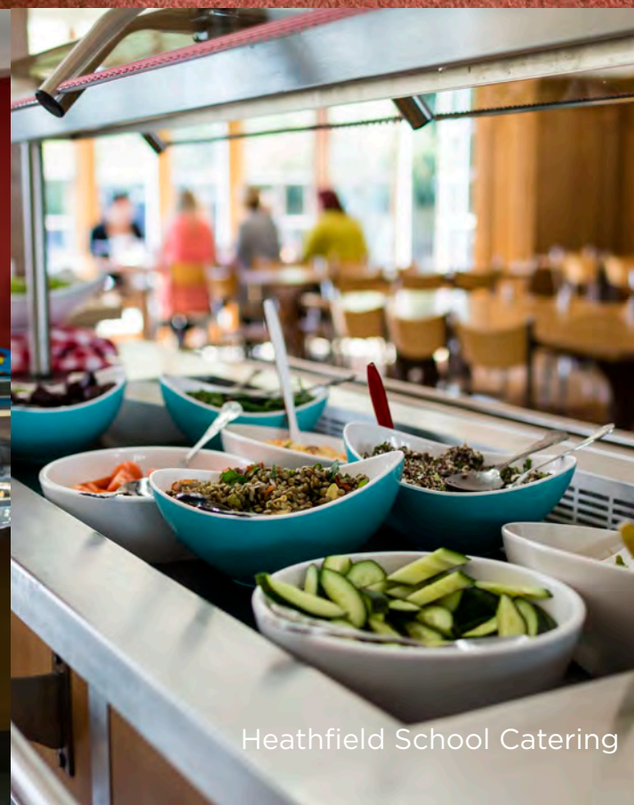
Heathfield School Catering